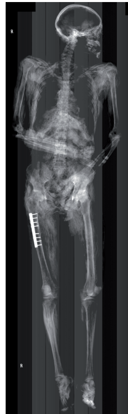
Fig. 1 (left). Decomposed body on which some identification had been found. Cause of death undetermined. A Lodox scan revealed no bullets, but plate and screws in the right upper femur confirmed identification.

The Statscan/Lodox system has clearly demonstrated the following advantages in a medico-legal unit.