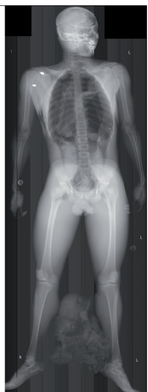
Fig. 2. Firearm fatality, multiple bullet wounds with difficulty in establishing entrance and exit wounds and defects (see sketch). Corresponding wound tracks were therefore difficult to establish. Retained bullets were suspected, but a Lodox scan revealed only two, in the right shoulder.