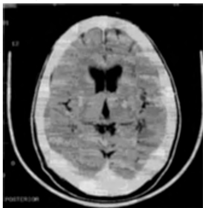
Fig. 1b. Post-treatment contrast-enhanced CT scan of the same patient showing resolution of the oedema, decrease in contrast uptake and residual hypodensity.