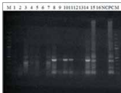
Fig. 1. Gel photograph of primary PCR product showing bands of various sizes. The human serum samples are shown by lanes 1 - 16. NC, PC and M denote the negative control, positive control and 100 bp ladders, respectively.

The prevalence of T. gondii among the workers ( n =6) in the chicken slaughterhouse was significantly higher than among workers ( n =81) in the seven cattle-sheep-goat slaughterhouses (100% v. 34.6%; p =0.003), when these were compared as two different study sites based on type of livestock slaughtered.