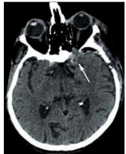
Fig. 1. Cranial CT showing a tumorous mass in the left orbital apex (white arrow).

Aspergillomas of the orbit were reported more often in the 1960s and 1970s and less in the 1980s and 1990s. There was an increase