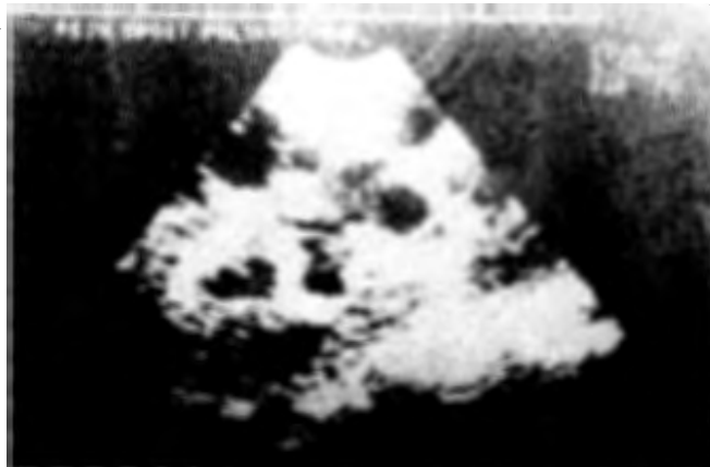
Fig. 1. Ultrasound scan of a kidney showing multiple cysts.