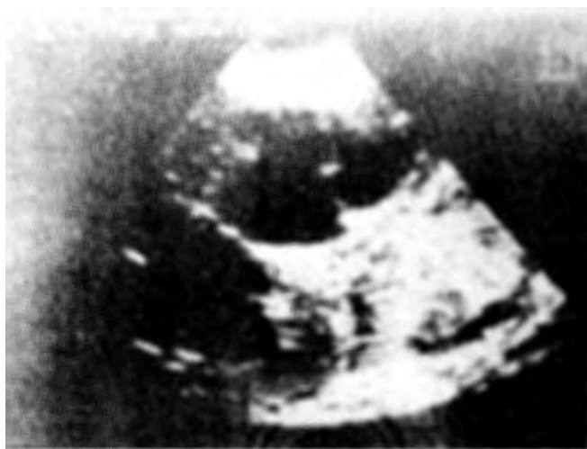
Fig. 2. Ultrasound scan of a liver showing multiple cysts.