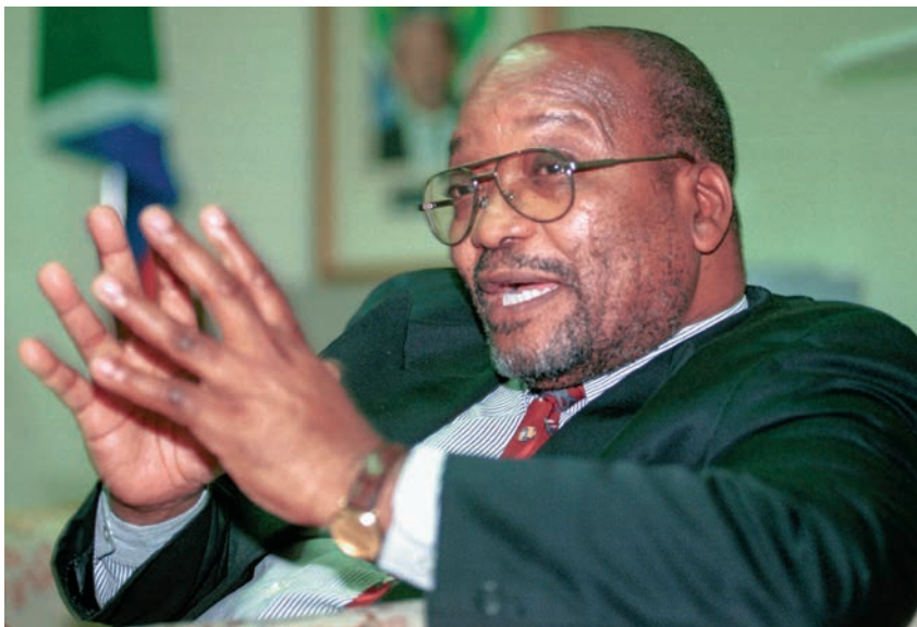
President Jacob Zuma.

Meanwhile healthcare bodies are attending a flurry of NDoH 'stakeholder consultation' workshops aimed at penning regulations to mitigate the sweeping new legal provisions – while consulting lawyers to protect their rights. Failure to comply with the new law is punishable by a fine, 5 years' imprisonment, or both. The three doctor bodies, the South African Medical Association (SAMA), the South African Dental Association (SADA), and the SA Private Practitioners Forum (SAPPF) (specialists), agree with the noble intentions of the law, but see it as a blunt and coercive instrument that will have grave unintended consequences.