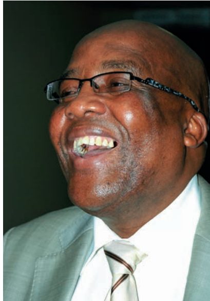
National Minister of Health, Dr Aaron Motsoaledi.