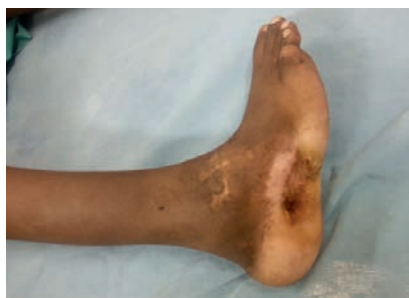
Fig. 9. Trophic ulcer on the lateral border of the foot secondary to hindfoot varus in a patient with L5 myelomeningocele.

muscles that extend the toes. The eventual plantar-flexed first ray thereafter drives both cavus, resulting in hindfoot varus (Fig. 8). Treatment is dictated by the mobility of the subtalar joint. If mobile, surgery is via soft-tissue release and tendon transfer – usually plantar release and peroneus longus to brevis tendon transfer. If stiff, then soft-tissue and bony procedures, such as a lateral closing wedge osteotomy of the calcaneus, are required.