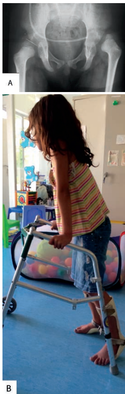
Fig. 3. (A) L4 myelomeningocele: underdeveloped femoral heads, dysplastic acetabuli, dislocated left hip and subluxated right hip. (B) Patient with mid-lumbar L4 level walking with ankle-foot arthroses and crutches in spite of bilateral dislocated hips.

Cavovarus occurs in S1 level myelomeningocele patients owing to an imbalance between the intrinsic and extrinsic foot muscles. There is motor function to peroneus longus, a plantar-flexed first ray, but less power to the intrinsic