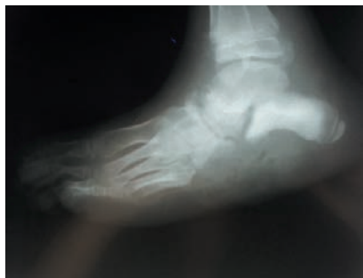
Fig. 7. Calcaneal and mid-foot osteitis in an L5 myelomeningocele.