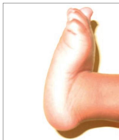
Fig. 5. Rocker bottom deformity in congenital vertical talus.