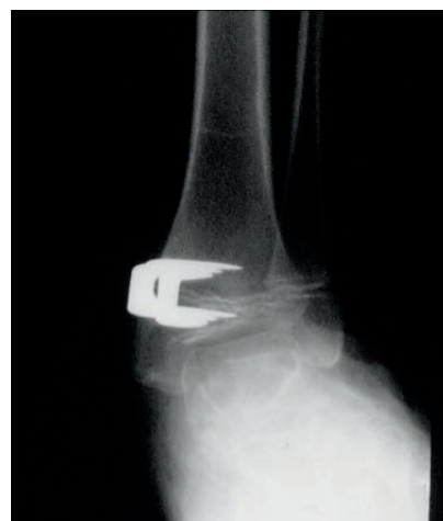
Fig. 6. Stapling of the medial distal tibial physis to correct valgus deformity.