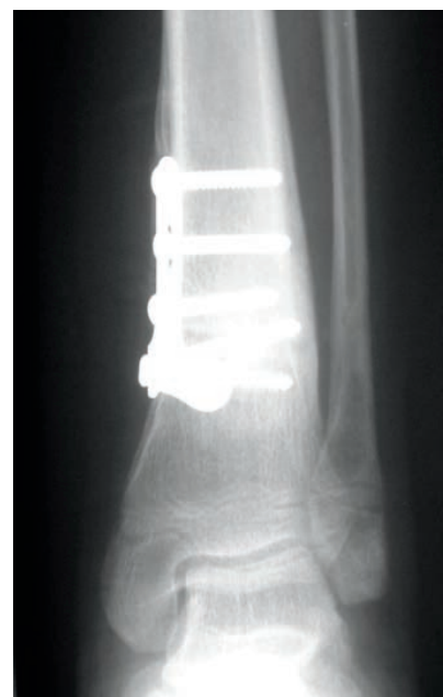
Fig. 4. T-plate fixation after de-rotation tibial osteotomy.