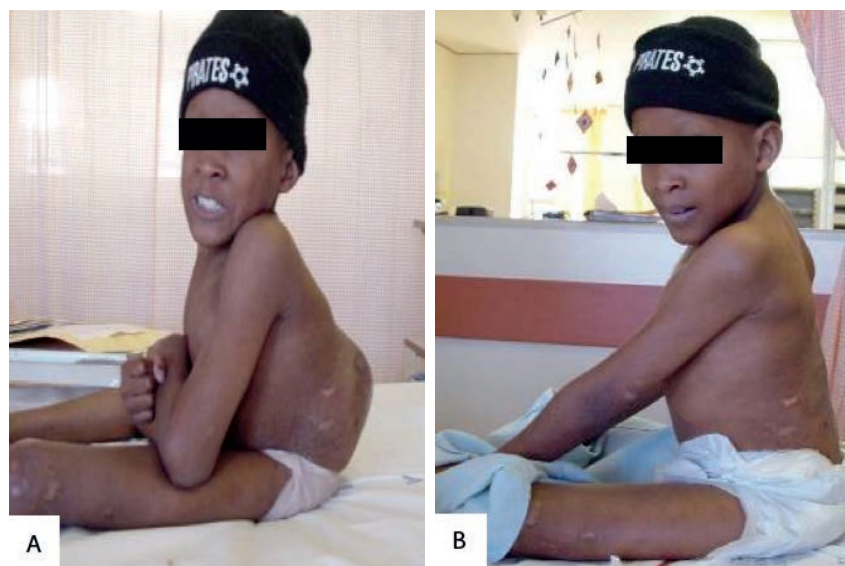
Fig. 2. (A) Patient with marked kyphotic deformity. (B) Patient after kyphectomy and posterior fusion.