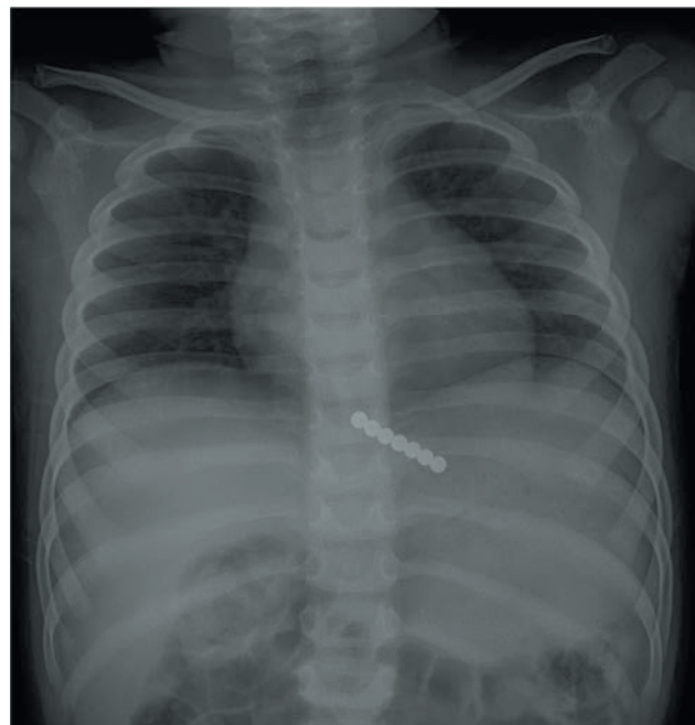
Fig. 1. Chest X-ray showing seven closely approximated beads in a 3-year-old child presenting with abdominal pain. The top two beads were in the oesophagus, while the remaining five were endoscopically retrieved from the fundus of the stomach.

Numerous magnet toys have been implicated in this growing problem, with an estimated 1 700 ingestions treated in emergency departments in the USA between January 2009 and December