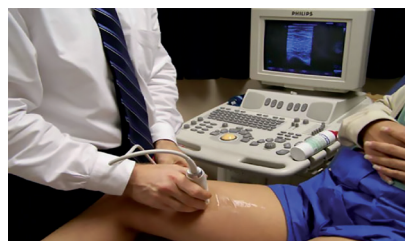
Fig. 1. Venous duplex is the cornerstone of initial venous diagnostic assessment.

The development of high-resolution computed tomography (CT) with contrast