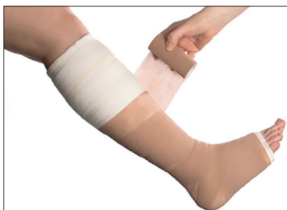
Fig. 3. Multilayered compression bandaging.

In advanced CVD, skin integrity may be compromised, thus making it important to maintain the health of the skin to prevent skin breakdown and infection. The development of eczematous dermatitis may require treatment with topical steroids. With venous ulcers, controlling bacterial overgrowth with aggressive woundcare may facilitate wound healing. A variety of hydrocolloids and foam dressings are available to manage wound fluid drainage and maceration of adjacent skin. In the presence of an infected ulcer bed, silver-impregnated dressings have been effective in controlling infection and restoring tissue integrity. However, because specific evidence-based guidelines are lacking, there is significant variation in