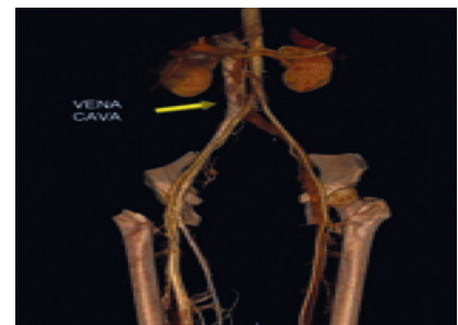
Fig. 2. Volume-rendered 3D reconstruction images of computed tomography venography are useful adjuncts to assess the iliocaaval anatomical segments in patients with advanced (C3 - C6) disease.

The initial management of CVD involves non-interventional measures to reduce symptoms and prevent the development of secondary complications and the progression of disease. Behavioural measures such as leg elevation to minimise oedema and structured weight loss programmes should be advocated. The use of compression stockings is the mainstay of medical management. If medical measures fail or provide an unsatisfactory response, further treatment should be considered. Specific treatment is based on the severity of the disease, with CEAP clinical classes 4 - 6