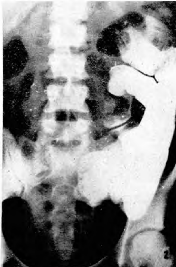
Fig. 2. Barium-meal X-ray.

Benzidine tests on the stool were negative for occult blood. Sigmoidoscopy was normal. A 3-day fat balance (intake 70 g. per day) showed 85.5% absorption (normal 95-100%). An oral glucose tolerance test revealed a flat curve (fasting 92 mg.%; ½-hour 98; 1 hour 103; 1½ hours 103; 2 hours 92). Xylose absorption: 3.7 g. passed in the urine during the 5 hours after the oral administration of 25 g. of d-xylose (see below).