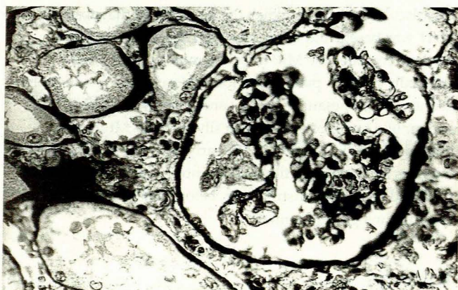
Fig. 2. Glomerulosclerosis affecting mainly the axial regions. Jones' silver, \times 400 .