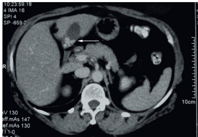
Fig. 1. CT scan showing gallstones (arrow) in a left-sided gallbladder.