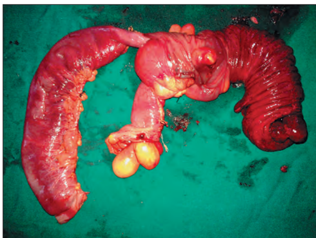
Fig. 2. Resected segment of jejunum with intestinal lipomatosis.

susception, with colocolonic intussusception reported as having a neoplasm as lead point in 69% of cases, and 70% of cases being due to malignant disease. 4 Benign lesions acting as lead points of intussusceptions are most commonly pedunculated, such as adenomatous polyps in the colon, Peutz-Jeghers polyps in the small bowel, and lipomas. Less common causes include postoperative factors (adhesions, suture lines, intestinal tubes) and Meckel's diverticulum, coeliac sprue, HIV infection and intramural haematoma. 6,7