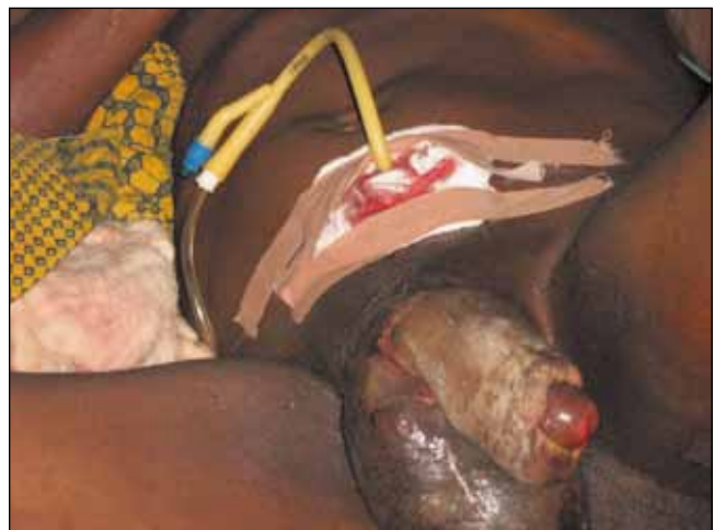
Fig. 1. Penoscrotal Fournier's gangrene with suprapubic cystostomy before debridement.

Fournier's gangrene is no longer considered idiopathic, because the pathological features are well defined and the portals of entry