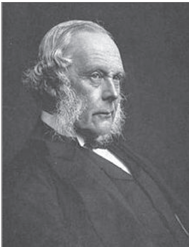
Fig. 1. Sir Joseph Lister (1827 - 1912), the father of modern surgery.

Joseph Lister was the pioneer of antiseptic surgery (Fig. 1). In the late 19th century, postoperative sepsis accounted for the death of almost half of the patients undergoing major surgery.