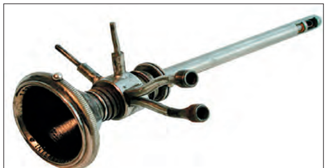
Fig. 2. Max Nitze (1848 - 1906) and the cystoscope he invented.