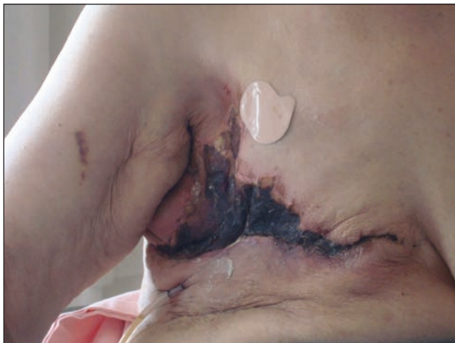
Fig. 1. Superior flap necrosis and nitroglycerin application in a patient with diabetes mellitus.

The rate of recovery without a major complication was statistically significantly higher in patients treated with local nitroglycerin than in the control group ( p<0.001 ) (Fig. 2).