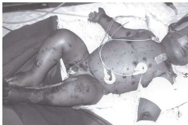
Fig. 1. Typical rash of meningococcal septicaemia with small to large or confluent purpuric lesions.

Medical management includes systemic support, antibiotics, correction of plasma deficiencies, and when required, anticoagulant and thrombolytic therapy. 5,6 Surgical treatment depends on the nature and extent of tissue damage and may include decompression during the acute phase, and subsequently debridement of necrotic tissue, skin grafts, local microvascular flaps, and amputations. This study describes our experience with the management of children with purpura fulminans seen since 1977, with the goal of developing a management protocol that could perhaps limit the extent of tissue injury.