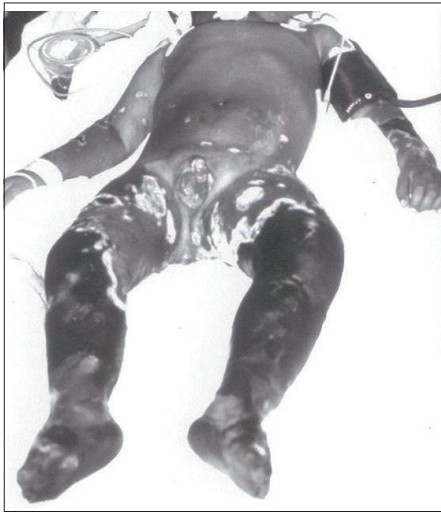
Fig. 4. Peripheral limb ischaemia with a clear demarcation line, with absent perfusion in the lower limbs. Emergency soft-tissue decompression was not done. Both lower limbs were amputated.

Management of skin necrosis presents a difficult problem. It is important to allow the necrotic area to demarcate fully, which may take several weeks (Fig. 4). The lesion is usually a thick necrotic eschar, which provides favourable conditions for bacterial growth with rapid bacterial multiplication and invasive sepsis. Histological analysis and quantitative cultures revealed a polymicrobial infection with both Gram-positive and negative organisms. Small areas can be left to heal through a process of spontaneous separation, wound contraction and healing by secondary intention. This occurred in one-third of our children. Alternatively, the areas can be excised with primary closure if they are located in cosmetically and functionally important areas. If left to heal spontaneously, unsightly scars may develop.