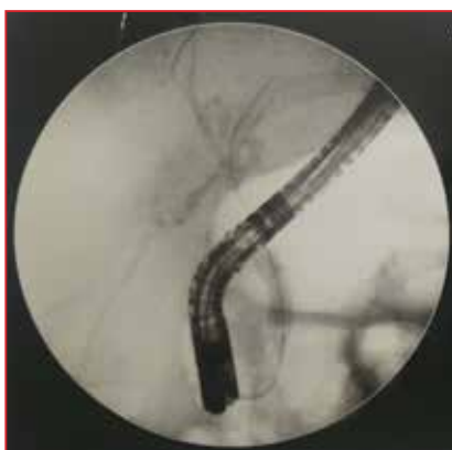
Figure 3. Postoperative ERCP demonstrating contrast leak (pre stenting)

Intraoperative cholangiography (performed via the perforation using a size 8FG infant feeding tube) confirmed ductal anatomy and excluded distal obstruction (Figure 2). As there was no T-tube immediately available, no attempt at repair of the perforation was made. Peritoneal lavage was performed. The bile duct was drained externally using an 8FG infant feeding tube and wide drainage of the sub-hepatic space was accomplished with use of a Yeates drain. Cholecystectomy was completed uneventfully.