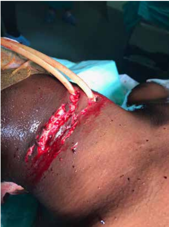
Figure 1. Self-inflicted neck wound