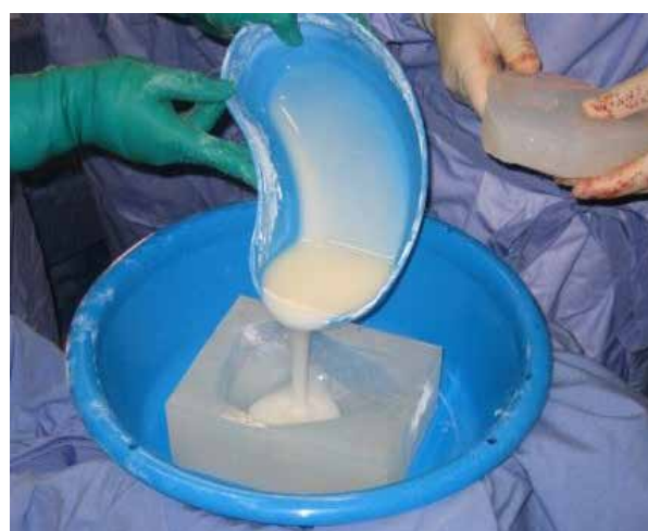
Figure 2: PMMA is mixed and placed in the mould.