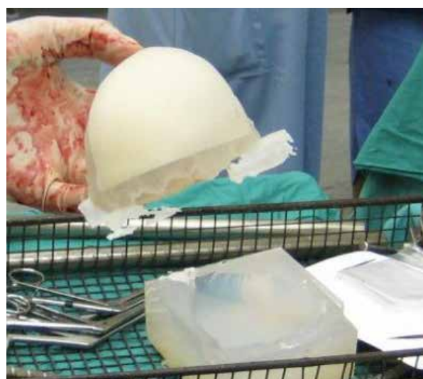
Figure 3: A custom implant. Excess PMMA is easily trimmed.

the defect is appreciated. PMMA is mixed and placed in the mould. After it has set and cooled, minor trimming of the graft is done and secured in place with cranial fixators and/or miniplates. Prophylactic antibiotics are given routinely prior