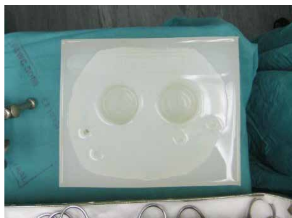
Figure 1: A two piece custom silicon mould that can be autoclaved.

The silicon mould is autoclaved just prior to the procedure and presented to the surgeon once the defect is exposed. Dural edges are freed until the full thickness of the skull surrounding