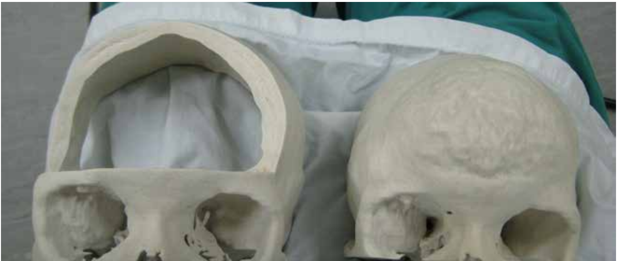
Figure 4: Pre-surgical planning of an intraosseous meningioma. A planned craniotomy is done on the 3D model.