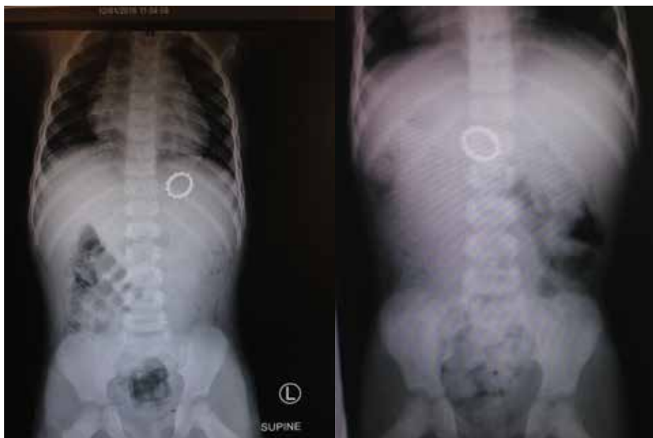
Figure 1: a) Initial plain abdominal x-ray showing ring in stomach, (b) Lodox, AP view 4 weeks later showing ring in the stomach.