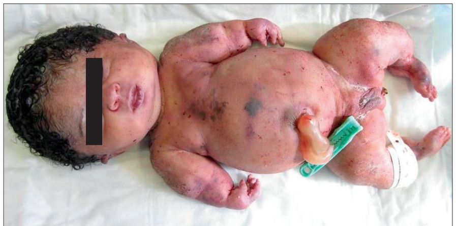
Fig. 1. A female fetus was stillborn at 34 weeks' gestation, with a birth length less than the 3rd centile and an upper:lower segment ratio of 2.25 (increased). The following dysmorphic features were noted: soft skull, blue sclera, prominent beaked nose, small mouth, short upper limbs (both rhizomelic and mesomelic segments) and bowed lower limbs.

Osteogenesis imperfecta (OI) is a heterogeneous group of genetic bone disorders that are characterised by decreased bone mass, increased bone fragility and susceptibility to fractures. The severe, perinatal lethal form (Type II) (OMIM 166210) is characterised by bone fragility, with perinatal fractures, severe bowing of long bones, undermineralisation, and death in the perinatal period owing to respiratory insufficiency. The overall prevalence of OI Type II is unknown. There are three subtypes of OI type II (A, B and C) that are characterised by different radiological features, and may be caused by different genetic faults. 1 Two fetuses with OI Type IIA are presented. As there is no molecular genetic testing currently available