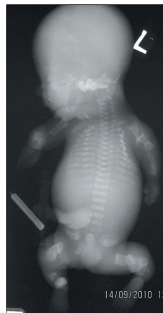
Fig. 3. Babygram X-ray of Patient 2 demonstrating generalised undermineralisation and evidence of multiple fractures. The skull is poorly ossified. The ribs show continuous beading. All long bones are short and broad with crumpled shafts.

in South Africa, the diagnosis of OI Type IIA relies on the accurate recognition of typical clinical and radiographic features. Parents can be reassured that the recurrence risk for future pregnancies is low, as most affected individuals have de novo mutations.