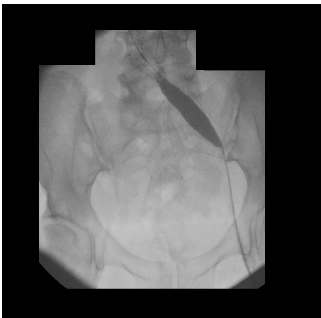
Fig. 2. Frame grab during deployment and balloon dilatation of the stent in Fig. 1.