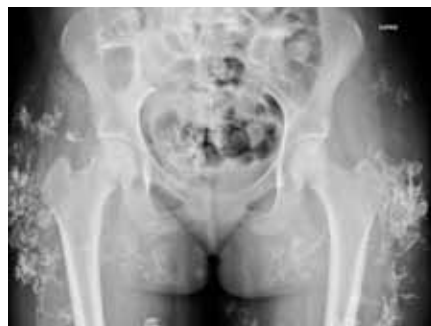
Fig. 2a. Frontal radiograph of the pelvis demonstrating extensive soft-tissue calcification.