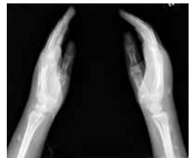
Fig. 2b. Lateral radiograph of the hands including the wrists demonstrates soft-tissue calcifications of the forearm.