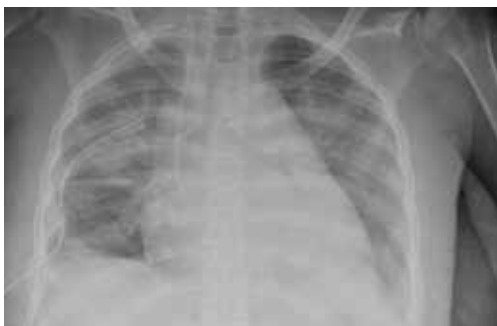
Fig. 1. Chest radiograph demonstrates cardiomegaly with a right pleural effusion.

Her chest radiograph showed a right pleural effusion with cardiomegaly (Fig. 1), and radiographs of the hips and hands demonstrated widespread calcifications in the soft tissue and no evidence of arthropathy (Figs 2a and b). A computer tomography (CT) scan confirmed the findings noted on the chest radiograph and further demonstrated calcifications around the shoulder and in the breast and back (Fig. 3). The soft tissue calcifications noted on the other radiographs were confirmed to be in the subcutaneous tissue and found to be more widespread in the lower limbs than noted on the plain film radiographs (Fig. 4).