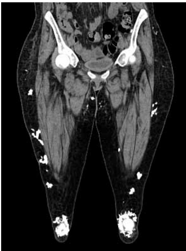
Fig. 4. Coronal CT scan of the proximal lower limbs demonstrate extensive calcifications in the subcutaneous tissue around both knees as well as both thighs.

The dermatologists confirmed that the skin lesions were in keeping with SLE. A diagnosis of calcifying panniculitis owing to SLE was considered, but a skin biopsy showed no significant inflammatory infiltrate; a final diagnosis of calcinosis cutis universalis associated with SLE was made.