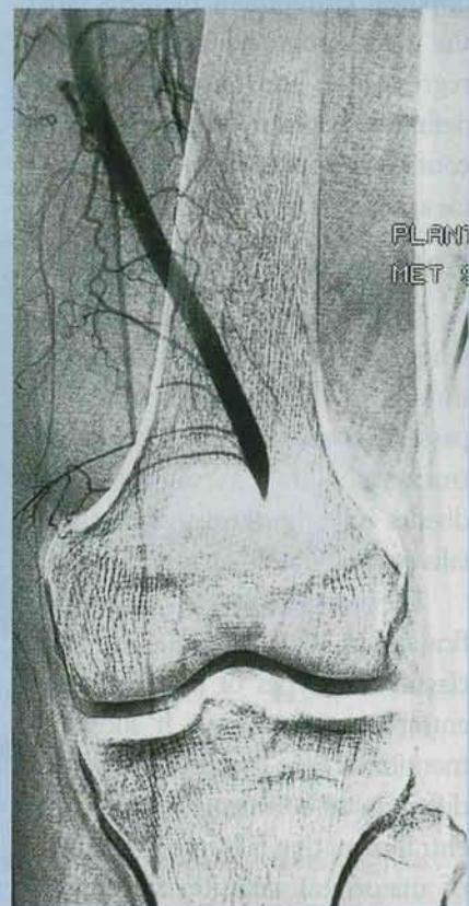
Fig. 2. Conventional angiography showing complete cut-off of the popliteal artery during forced plantar flexion.

During this time the popliteal artery develops from the union of the