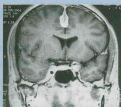
Fig. 6. Post-gadolinium T1 sequence coronal image showing dense peripheral enhancement compared with the centre.