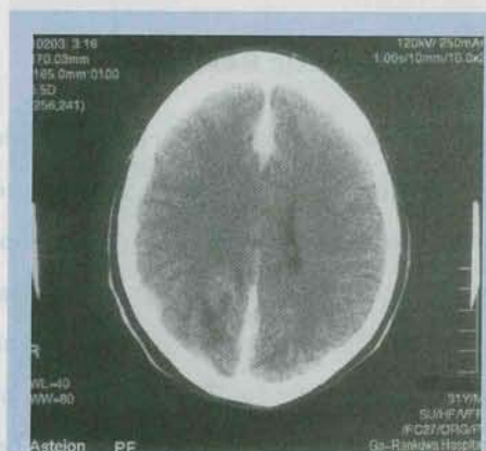
Fig. 1. Non-enhanced CT brain scan showing thickened hyperdense falx cerebri and dura mater overlying the right occipital and parietal areas as well as bifrontally. A hypodense area can be seen in the right occipital lobe.

The dura mater overlying the right parieto-occipital area, anterior and posterior parts of the falx cerebri as well as right tentorium showed very low signal on T2-weighted (Fig. 3) and FLAIR sequences. The T1