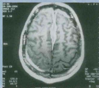
Fig. 5. Axial post-gadolinium T1-weighted image demonstrates the dense enhancement of the suspicious areas noted in Fig. 4.