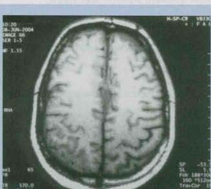
Fig. 4. Axial T1-weighted image shows possible hypointense thick falx which is almost iso-intense to the cortex.

sequence of these areas was iso-intense to the cortex (Fig. 4). No CSF was noted in these areas. The periphery of these lesions showed dense enhancement post contrast on T1