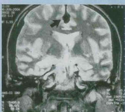
Fig. 3. Coronal T2-weighted sequence demonstrating the very low signal of the thickened falx cerebri and tentorium on the right.