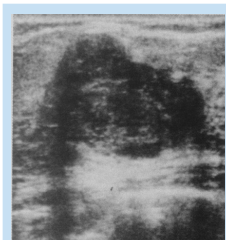
Fig. 1a. Transverse section of fibroadenoma on ultrasound.