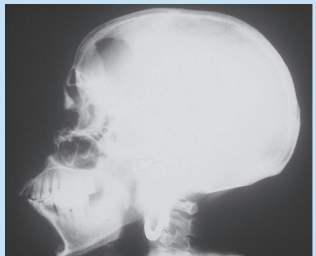
Fig. 1. Lateral skull X-ray: a right frontal bone defect.

Botryomycosis of the skin should be differentiated from mycetoma, actinomycosis, abscesses, and tuberculosis. It also depends on the site of infection. Treatment depends on the causal microorganism isolated.