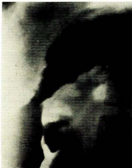
Fig. 1. See text.

Petersen 3 similarly reported a case of calcification in