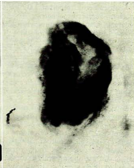
Fig. 3. See text.