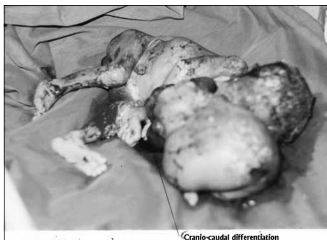
Figure 2: Fetus-in fetu with cranio-caudal differentiation