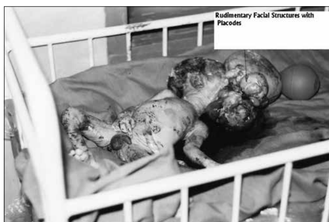
Figure 4: Fetus-in fetu with placodes and rudimentary facial structures

are related entities, because they possibly have the same developmental malformation. [9] In fact, in a large review of intracranial tumors, it was found that there are some transitions between certain teratomas and fetus-in-fetu. [10]