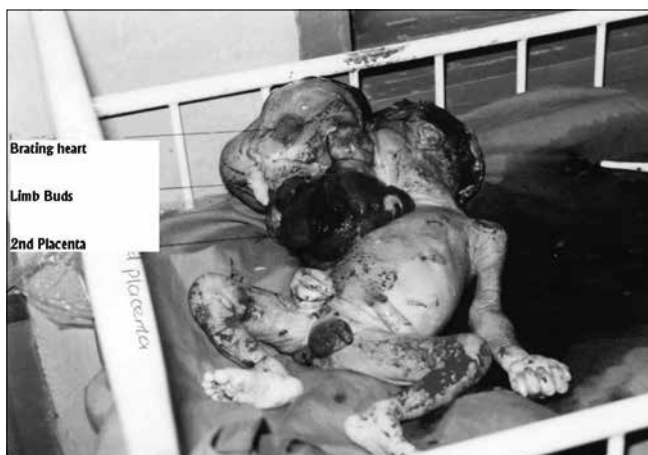
Figure 3: Fetus-in Fetu with differentiated beating heart, limbs and placenta mass