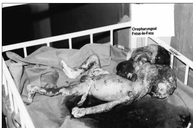
Figure 1: Oropharyngeal fetus-in fetu