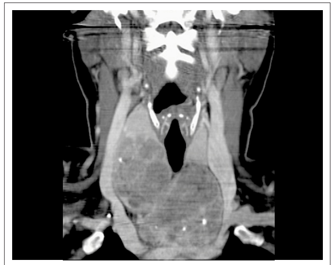
FIGURE 4: Coronal CT scan image of anterior neck triangles.