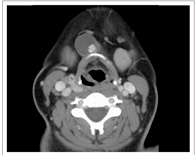
FIGURE 2: Axial CT scan image at level of hyoid bone.