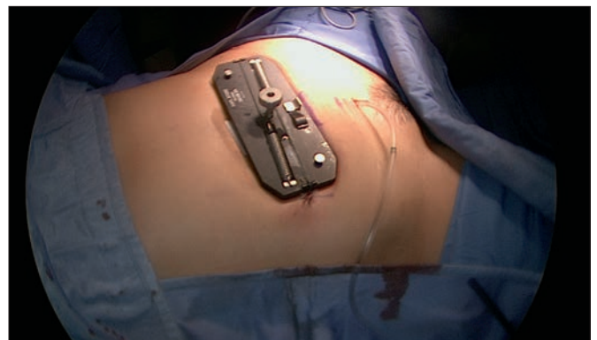
Fig. 4. The traction device.

Pain due to tightening of the traction threads was managed with epidural anaesthesia. Dilators were used for 6 months in combination with liberal application of oestrogen cream to treat oestrogen deficiency and for lubrication. After 3 months the patient started having intercourse. The vaginal size achieved was 7 cm length \times 4 cm width. No surgical complications were described, but vaginitis was reported and treated at a follow-up visit.