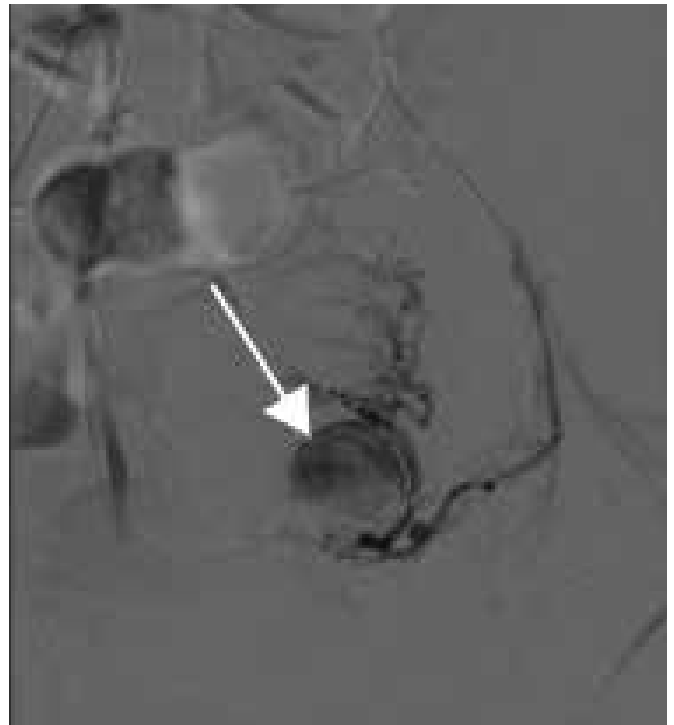
Fig. 2. Angiography showing pseudoaneurysm of the left uterine artery.

Postpartum haemorrhage remains one of the major causes of maternal mortality. Secondary postpartum haemorrhage is defined as excessive bleeding that starts any time from 24 hours after delivery up to 6 weeks postpartum, and most commonly occurs between 8 and 14 days postpartum. [1] Common causes include retained gestational products, subinvolution of the placental bed, and endometritis. Rare causes include PA of the uterine artery, arteriovenous malformations, C/S delivery and choriocarcinoma. When the more common causes have been excluded, pelvic angiography may be performed. PA of the uterine artery should be listed as a possible cause of postpartum haemorrhage after C/S. [4] Trauma to the uterine artery during surgery may cause a defect in the arterial wall, through which arterial blood escapes and diffuses to the adjacent tissues, resulting in the formation of a haematoma. When this haematoma is in continuity with the uterine artery, which supplies continuous blood flow, a PA forms. The absence of a three-layered arterial wall lining in a PA differentiates it from a true aneurysm. [5]