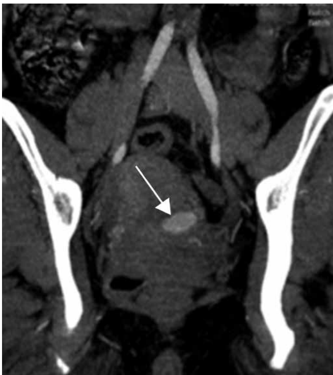
Fig. 1. Computed tomography angiography showing pseudoaneurysm of the left uterine artery, which measured 4 cm in diameter.