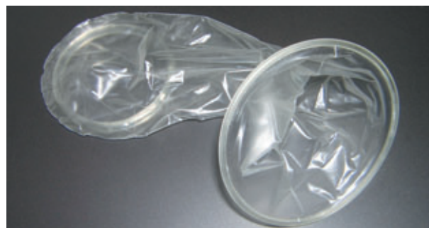
The female condom.

first year of use compared with 15% of male condom users. 9 With correct and consistent use, 5% of female condom users and 2% of male condom users will experience a pregnancy in the first year of use. More recent studies in China, Panama and Nigeria showed higher effectiveness rates of 94 - 98% for the female condom compared with 92 - 96% for the male condom. 10 Regarding prevention of STIs, a systematic review found that female condoms confer as much protection from