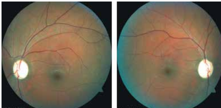
Fig. 1. Funduscopy of patient 1, showing bilateral optic atrophy and normal retinas.

His visual acuity bilaterally was 'counting fingers'. Central scotomas were noted on confrontation, but HVF showed bilateral, inferior altitudinal field defects. Colour vision was severely impaired (0/15 on Ishihara pseudo-isochromatic plates) and funduscopy revealed bilateral profound optic atrophy (Fig. 2). His pupils were reactive and a 1+ relative afferent pupillary defect was present on the right. The rest of his neurological examination was normal, and standard haematological, biochemical and CSF examination tests were normal. His CD4 + count was 615 cells/ \mu l and viral load was 27 copies/ml. MRI of the brain and orbits was normal, as was his chest radiograph. The VEP P100 wave amplitudes were reduced bilaterally. His vitamin B 12 level was mildly reduced at 117 pmol/l (normal 133 - 675), serum folate was normal and SACE was