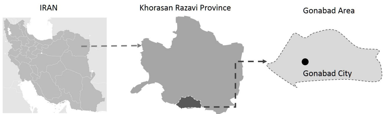
Figure 1: The location of Gonabad city in the country

ICHHTO (Iran Cultural Heritage, Handicrafts and Tourism Organization) Khorasan Razavi province requested the documentation of the historic core of the city based on the architectural elements as a research project due to the policies of the country. Therefore, the research took the position in the city based on the documentation of the historic elements in the city, which located in the northeast of IRAN, as shown in Figure 1.