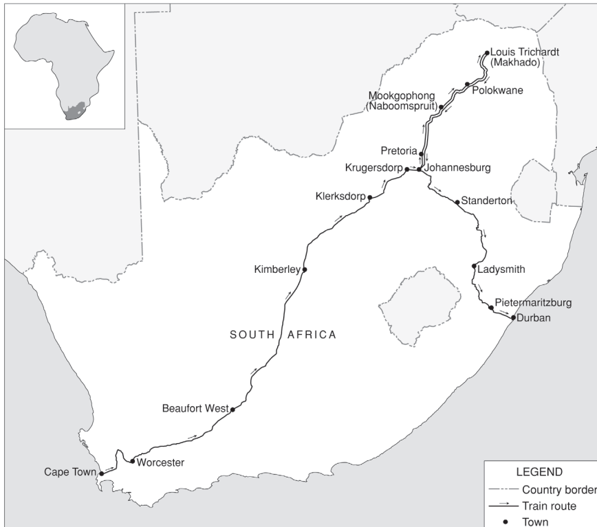
Figure 4. Climate Train route through South Africa