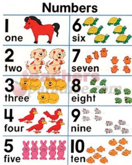
Figure 3 Number chart from a workbook