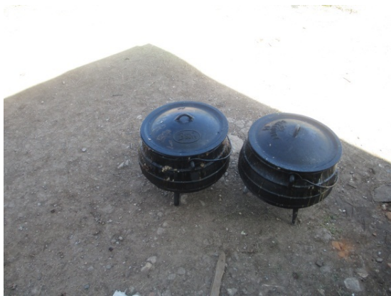
Figure 5 Imbiza: Three-legged pots