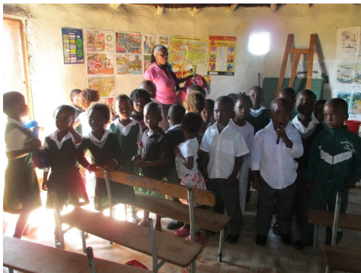
Figure 1 A typical Grade R classroom in Cofimvaba

ship with the teachers and community of Cofimvaba has improved; trust has been established. When the teachers realized our commitment to listen to them earnestly, they committed unreservedly to investing their time and intellectual capital in the project. Field researchers from Cofimvaba, both from the community and schools, were trained in basic research practices, with a focus on collecting data, and dealing with research participants, in a manner that is participatory, sensitive, and respectful of research participants. In turn, they have collected data on totem animals, and Cofimvaba villages' cultural heritages, including agricultural practices indigenous to Cofimvaba. Henceforth, the research team has engaged with teachers, principals of schools, and district officials in various workshops, in exploring: