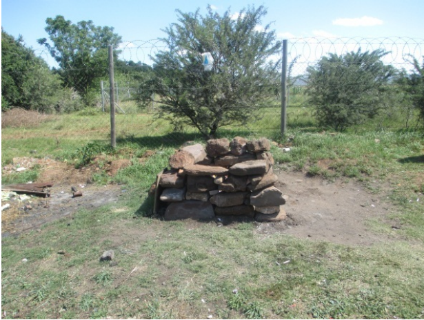
Figure 4 Iziko fireplace enclosure at Cofimvaba

on the other hand, what the teachers have indicated should form part of the content of the materials (Figures 4 and 5). The second set of images recognizes local and indigenous knowledge systems; and ensures that the content is shaped by local contexts to which learners can easily relate.