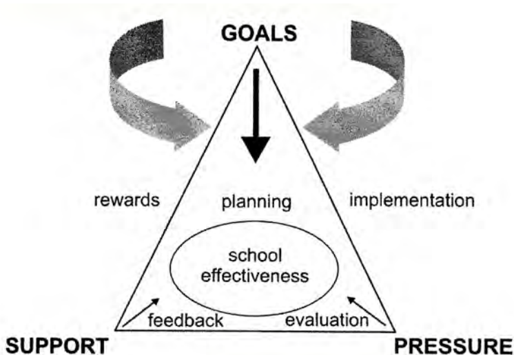
Figure 3 TCA : Assessment framework based on the contextual factors of goals, pressure and support in pursuit of school effectiveness (adapted from Sun et al. , 2007:98)

In recent research on school effectiveness (Sun et al. , 2007; Creemers & Kyriakides, 2008; Kyriakides et al. , 2008a; Kyriakides et al. , 2008b; Van Damme, Opdenakker & Landeghem 2008), the authors emphasise, among other things, aspects such as national goal setting in terms of learner outcomes (i.e. learner outcomes and school effectiveness is firmly embedded in its national context), pressure in the form of strong central control and school accountability, and strong support from the community as some of the contextual factors that influence the effectiveness of schools.