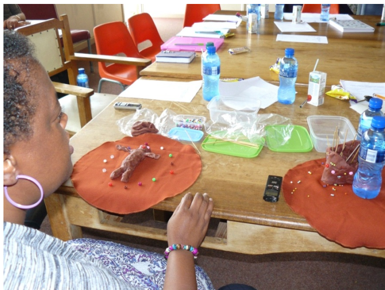
Figure 3 APM 1 experimenting with the Mmogo-method TR

Because of the AP's earlier cautioning against one-on-one qualitative methods, the P2RP considered participatory visual methods that were suited to group settings. These included the Draw-and-write Method (Mitchell, Theron, Stuart, Smith & Campbell, 2011), the Mmogo-method TR (Roos, 2008), and Participatory Video (Mitchell, Milne & De Lange, 2012). In the second operational phase , APMs experimented with these methods (see Figure 3) during specially arranged AP-P2RP meetings. Using their lived experiences of these methods, the AP endorsed their use with the youth in the P2RP. APMs also noted the value of these methods to their own future service to the youth and concluded that they had been " up-skilled " (in the words of APM 11). Some also commented on the serendipitous therapeutic value the experience of trialling the methods had had; e.g. APM 9 reflected that the opportunity "[gave] me some therapy so I think this is a good thing that you [researchers] did, so thank you!"