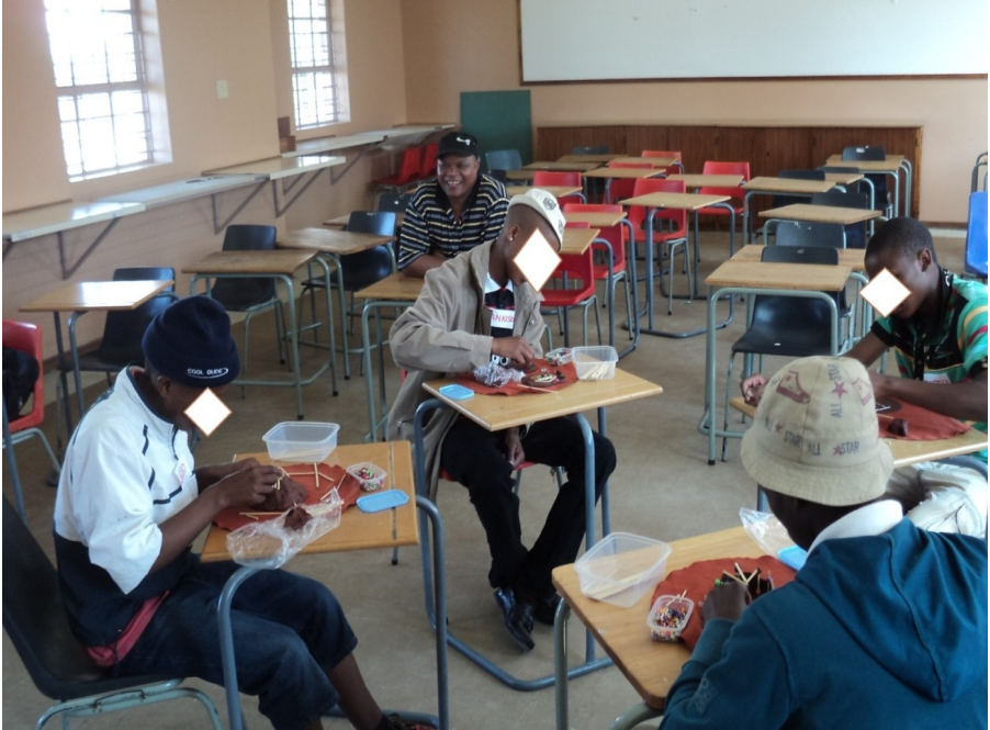
Figure 4 APM 11 observes QwaQwa youths in a Mmogo session

Figure 4). The AP also recommended local unemployed adults to be trained to help with (and be remunerated for) transcription and translation of qualitative data sets.