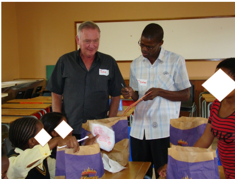
Figure 2 On the advice of the AP, participants received a Steers meal in gratitude for their participation 2

The one exception pertained to youth participants' compensation. The AP was unequivocal that, unlike in the other participating countries, the local youth could not receive a cash stipend, partly because adults could demand the money, or it could be stolen, or youths might spend it unwisely. Agreement was reached that youths would receive a meal from any local fast food vendor. This was honoured throughout the project (see Figure 2). In the formal 2011 external evaluation of the P2RP, APMs were invited to submit anonymous comments on their experience of being formally involved in the project. Two comments, in particular, testified to continued honouring of AP suggestions: "Our inputs are being taken seriously" and "We receive fulltime consultation, even telephonically, and we are part of decision making, which is important to us" .