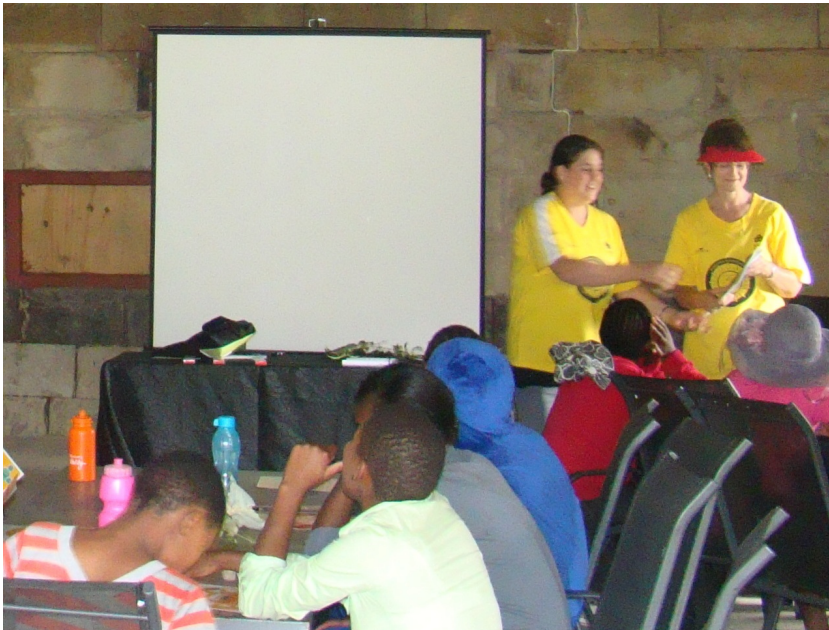
Figure 6 APM 12 and a PhD student participating in Khazimula dissemination with local youths

nervous. On one occasion, since they had participated in the Khazimula training, three local teachers expected to be included in a dinner being held to disseminate P2RP findings to community leaders. It is possible that because teachers were aware that P2R was a funded project, they expected to be rewarded for their participation in the dissemination phase, rather than interpreting their participation as an opportunity to learn how to use locally generated knowledge to promote local youths' resilience. Regardless of the reason, the APMs involved felt uncomfortable with the budgetary complications these expectations created for the P2RP.