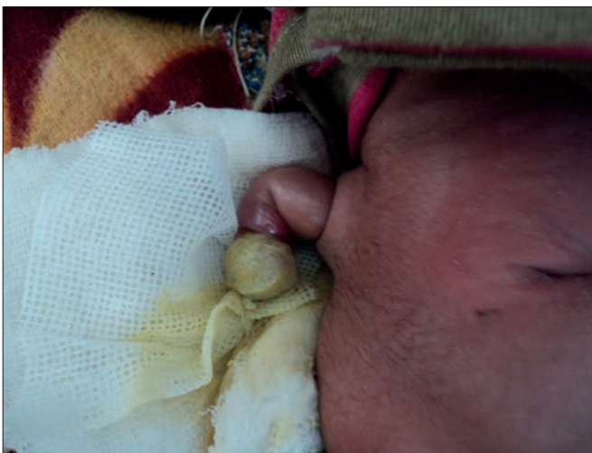
Fig. 1. The dorsal tail.

about 3 cm at birth and had been increasing in size. On physical examination, the appendage was tail-like, soft, well circumscribed, 5 cm long and 0.5 cm thick and was attached to the back of the tip of the coccyx, appearing like a human tail. It was soft, non-tender and covered with normal skin. There was no voluntary movement in the tail. The findings on general and systemic examination were otherwise normal. The child had no other congenital defect, and there was no family history of any developmental or congenital anomaly. The possibility of a true neonatal tail as opposed to a pseudotail (see below) was considered. Imaging of the spine showed a spina bifida in the lumbosacral area (Fig. 2). The patient was moved to the neonatal intensive care unit and the neurosurgeon removed the tail and repaired the meningocele. Histopathological examination revealed that the tail-like structure contained skin, muscle and adipose tissue only. The infant recovered uneventfully and no neurological deficit was evident on follow-up until 12 months of age.