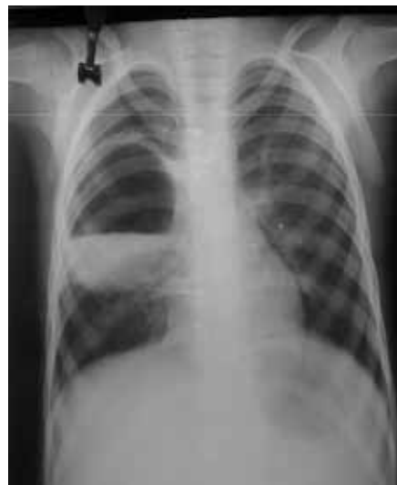
Fig. 1. Plain chest radiograph, postero-anterior view.

On examination at our institution he was pale and had a temperature of 38.3°C. There was no cyanosis, clubbing or lymphadenopathy. Chest examination revealed decreased chest expansion and air entry on the right side of the chest. The haemoglobin concentration was 9.7 g/dl and the white cell count 14.3 \times 10^9/l , with 82% neutrophils, 13% lymphocytes and 4% eosinophils. A chest radiograph showed a cystic lesion (Figs 1 and 2) with an air/fluid level. A provisional diagnosis of lung abscess was made. Intravenous antibiotics (ceftriaxone, sulbactam, amikacin, metronidazole) and antipyretics were commenced, and serological testing for hydatid disease was requested because the child came from a rural area and had close contact with livestock and dogs. The hydatid serological test was positive (titre 1:320). A