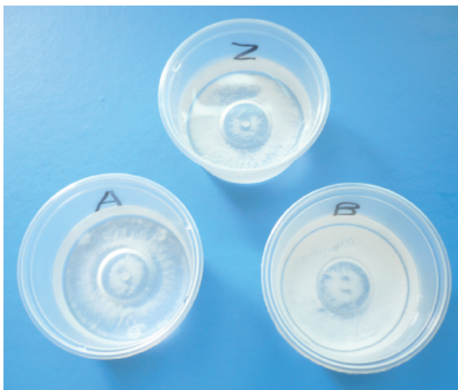
Fig. 2. Incomplete dissolution of stavudine capsules in water (Z = Zerit, A = Aspen Stavudine, B = Stavir).

The contents of Stavir capsules were extremely difficult to disperse in water despite prolonged agitation. Their contents appeared to be partially hydrophobic, floating persistently on the meniscus of the sample. Consequently, recovery of active drug was reduced (Table I). However, because of the small sample size, the difference in recovery of active drug from solution when comparing Zerit with Stavir did not reach statistical significance ( p=0.1730 ).