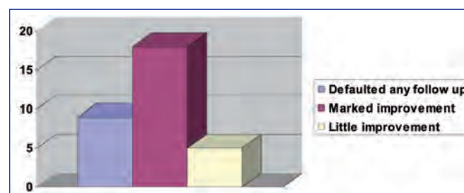
Fig. 2. Long-term follow-up.

The duration of follow-up at the hospital outpatient department ranged widely from 2 weeks to 4 years, and it is possible that patients were followed up by their referring institutions. Nine patients had no record of any postoperative follow-up at Red Cross Hospital. One patient (who had only undergone ductal translocation without excision of the sublingual glands) developed a ranula. For 23 patients there was some comment on the result of the procedure; 18 (78%) had shown 'marked' improvement, whereas the other 5 (22%) showed 'little' improvement (Fig. 2).