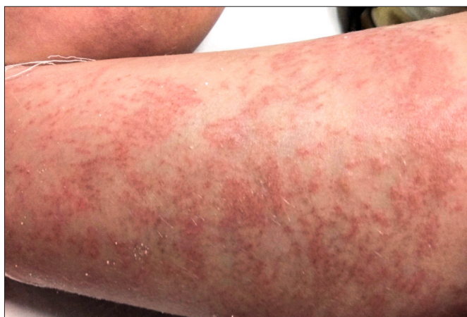
Fig. 2. Papular flagellate rash at the site of attachment of the jellyfish tentacles.

echocardiograph were normal. An ultrasound demonstrated diffuse subcutaneous oedema with moderate knee-joint effusion with septation. Computed tomography angiography showed attenuation in the calibre of the distal two-thirds of the right brachial artery, radial and ulnar arteries and faint contrast opacification (Fig. 3).