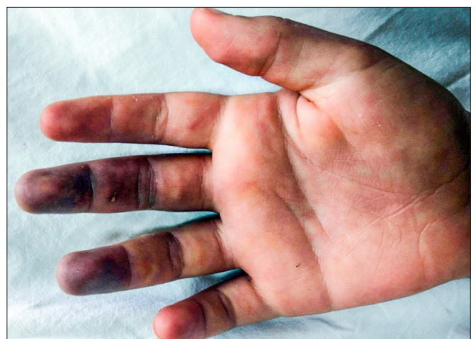
Fig. 1. Digital ischaemia of the fingertips following jellyfish sting.

The right upper limb arterial Doppler showed attenuation of the axillary, brachial, radial and ulnar arteries with a regular colour flow, flow velocities and spectral waveforms with low biphasic resistance and diffuse subcutaneous oedema. The renal artery Doppler and 2D