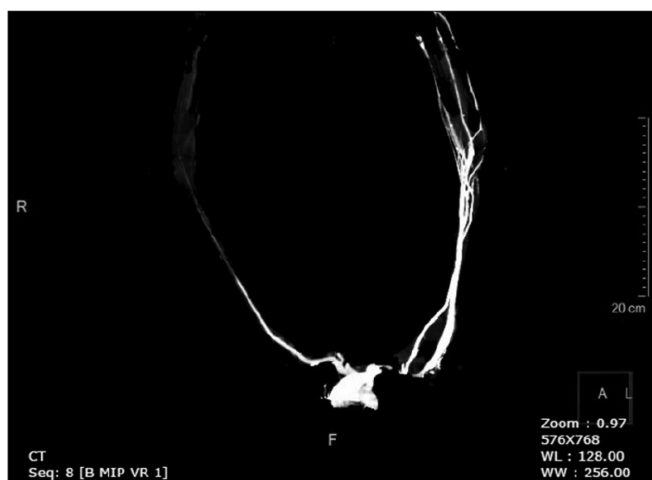
Fig. 3. Computed tomography angiograph showing narrowing and spasm of the right brachial, radial and ulnar arteries.

Jellyfish stings most frequently result in pain, itching, an intense burning sensation and redness in the majority of cases. However, a few studies show that allergic reactions and anaphylaxis are remote complications as the jellyfish toxin is known to act by inducing the release of inflammatory mediators. [10] The classical jellyfish dermatitis, also called seabather's eruption, is believed to occur