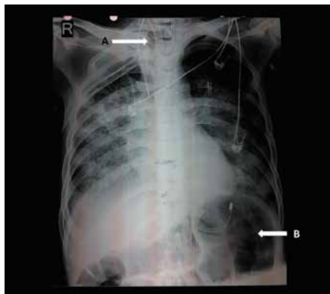
Fig. 1. Radiograph showing: (A) TT cuff air shadow extending beyond the confines of the trachea; and (B) grossly distended stomach.

normal cuff air shadow. On the 83rd post-tracheostomy day, we noticed rapidly progressive abdominal distension with each mechanical breath from the ventilator. The epigastric distension was relieved immediately on opening the proximal end of the NG tube. A clinical diagnosis of TOF was made. A bedside radiograph showed a TT cuff air shadow extending beyond the confines of the trachea and a grossly distended stomach (Fig. 1).