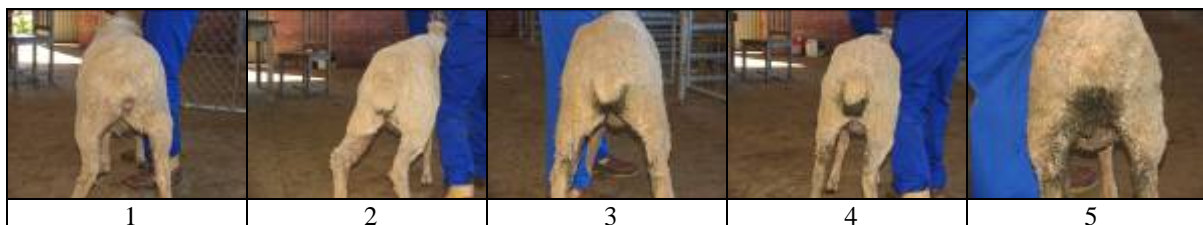
Figure 1 Photographic scorecard used to assist with the scoring of dags in the experimental animals.

The experimental outlay was factorial, with aloe treatment and sampling date as main effects. Eight sampling dates were considered in Trial 1, four in Trial 2, and three in Trial 3 as outlined above. As the same animals were sampled repeatedly in all experiments, the random effect of animal was included in all