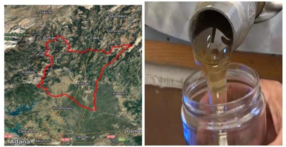
Figure 3 Honey samples were collected from 16 beekeepers in four locations spread out across the Adana province, Turkey

Honey samples were collected from 16 beekeepers in four locations spread out across the Adana province (Figure 3). The collected samples were labelled according to the information given by the beekeepers and stored under appropriate conditions (e.g. room temperature, 20–25 °C; away from direct sunlight) throughout the study. All honey were produced under controlled conditions with no sugar-feeding or adulteration. All organic solvents were of gas chromatography-grade quality; solid chemicals were Merck and Sigma-Aldrich quality.