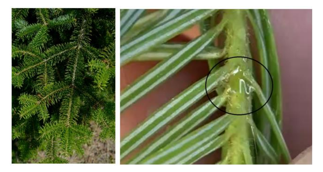
Figure 2 Taurus fir (Abies Cilicia spp.) and the secretion on the branches caused by insects

Aphididae. It was first seen by Mimeur in Morocco in 1935 and was described in 1936. Due to the use of Cedrus libani for wood and as an ornamental plant, C. cedri and C. libani have been distributed to different parts of the world (Binazzi et al. , 2015; Görür et al. , 2019). The secretion honey from these species has a high phenolic content and high antifungal and antioxidant capacities (Gül & Pehlivan, 2018). Cedar honey, which is also called Mezla honey, has an aromatic taste and a honeydew scent originating from the cedar trees. Unlike other secretion honey, cedar honey has a transparent colour, high viscosity, and does not crystallize.