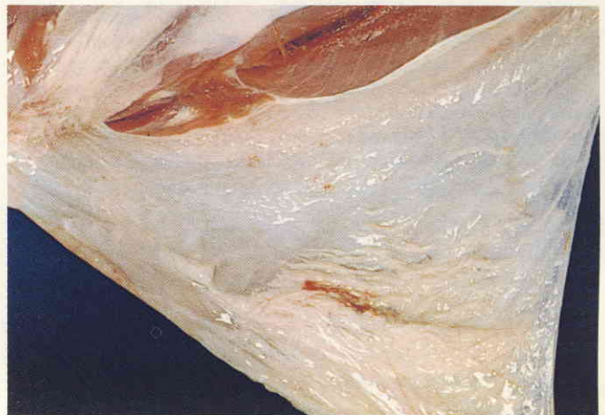
(b) Hindleg with accumulation of watery fluid in subcutaneous tissues.