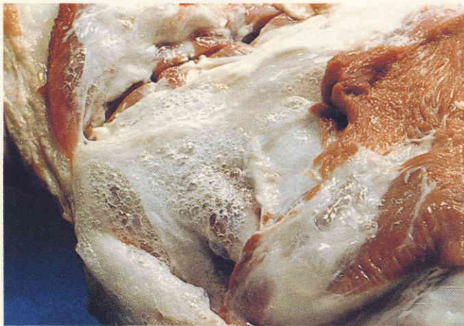
(a) Wet carcass with intermuscular connective tissue layers displayed.