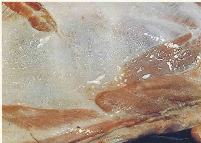
(c) Watery fluid in flank area.