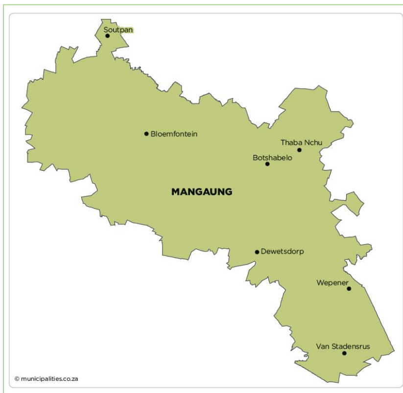
FIGURE 1: Mangaung Metropolitan Municipality Map.

The study was conducted in the Mangaung Metro Municipality, east of Bloemfontein, in the central Free State province. Mangaung district consists of four wards: Thaba Nchu, Botshabelo, Bloemfontein and Naledi. Figure 1 shows a map of the Mangaung Metro Municipality, where the study was conducted.